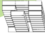
TriSlider System (T632LT8 shown) Storage Capacity - 1,960 LFI* Footprint - 32 Square Feet