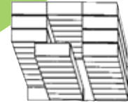
QuadSlider System (Q632LT8 shown) Storage Capacity - 2,520 LFI* Footprint - 43 Square Feet

*Linear Filing Inch capacities shown are based on letter-sized folders for 8-high, 36" wide units. Actual filing inches are based on type of media, width and height of ThinStak® units and available floor space. Contact your CSM representative for different configurations based on your filing needs.