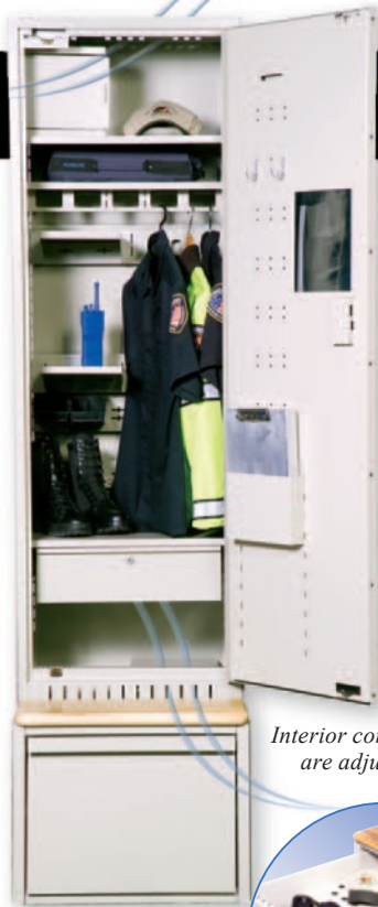
Interior components are adjustable