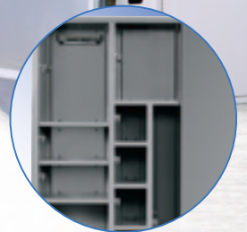
Pass-Thru Unit as seen from rear