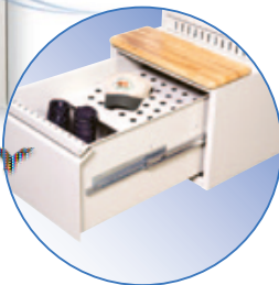
Drawer features a removable, ventilated body armor tray